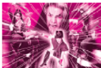
*Super Samurai Show* (This is an image)