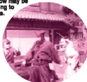
*Moviemaking Secrets True·False*

A movie school to teach moviemaking tricks (Performers: Toei Acting Staff) (No charge)